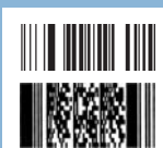
RSS &amp; PDF417 Codes