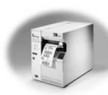
105 SL Printer